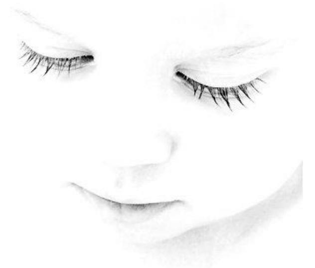
Virtual Campus http://www.midwifery.edu